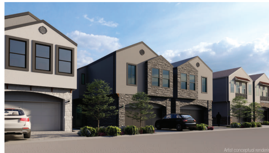
Artist conceptual rendering